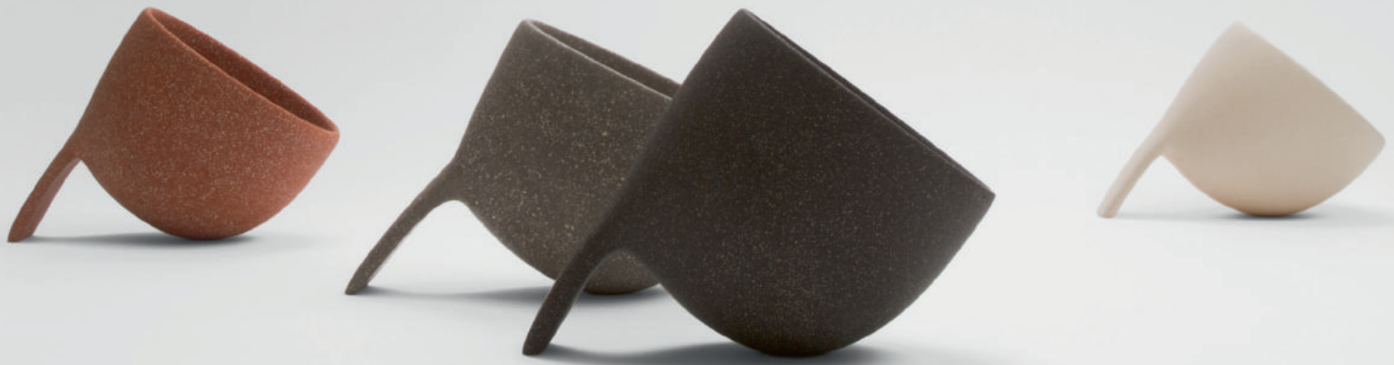
ABOVE: I am too ; left to right: terra (L:19cm), gray (L:17.5cm), chocolate (L:17cm), white (L:15cm), 2013; RIGHT: Empty Form (L:38cm), 2002; acquired by the Icheon World Ceramic Centre, 2008